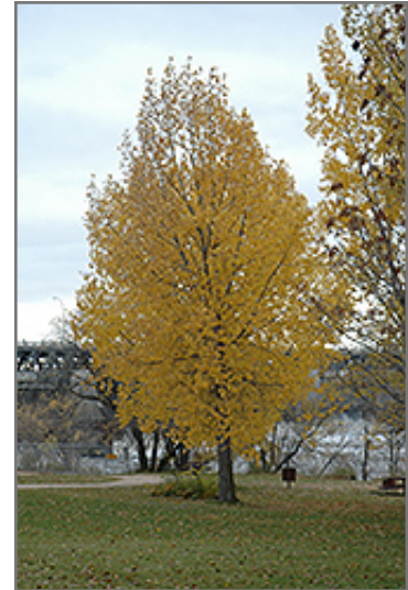
Siouxland Poplar in fall