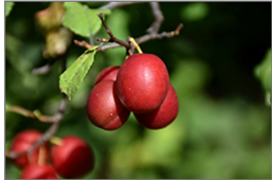
Toka Plum fruit

Toka Plum is blanketed in stunning clusters of fragrant white flowers along the branches in early spring before the leaves. It has forest green foliage throughout the season. The pointy leaves turn yellow in fall. The fruits are showy crimson drupes carried in abundance in late summer. The fruit can be messy if allowed to drop on the lawn or walkways, and may require occasional clean-up.