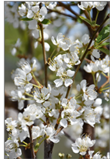
Toka Plum flowers