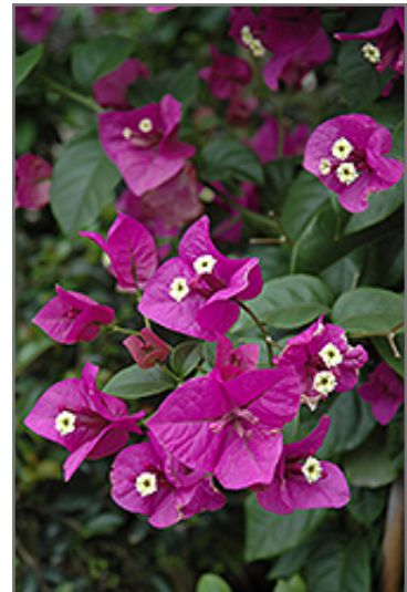
Purple Queen Bougainvillea flowers