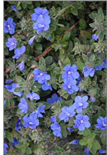
Blue My Mind Morning Glory flowers

Blue My Mind Morning Glory is recommended for the following landscape applications;