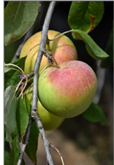
Zestar Apple fruit

Zestar Apple features showy clusters of lightly-scented white flowers with shell pink overtones along the branches in mid spring, which emerge from distinctive pink flower buds. It has forest green deciduous foliage. The pointy leaves turn yellow in fall. The fruits are showy red apples with hints of yellow, which are carried in abundance from late summer to early fall. The fruit can be messy if allowed to drop on the lawn or walkways, and may require occasional clean-up.