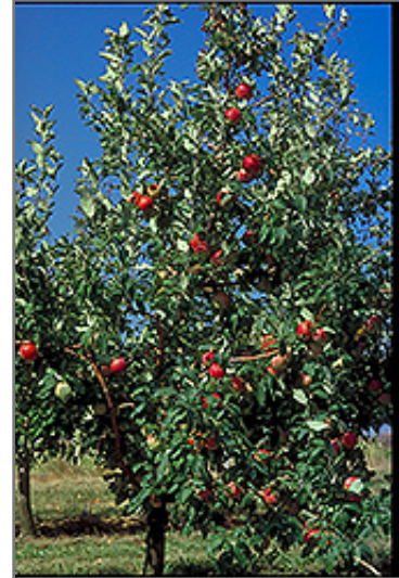
Zestar Apple fruit

This tree is typically grown in a designated area of the yard because of its mature size and spread. It should only be grown in full sunlight. It prefers to grow in average to moist conditions, and shouldn't be allowed to dry out. It is not particular as to soil type or pH. It is highly tolerant of urban pollution and will even thrive in inner city environments. This particular variety is an interspecific hybrid.