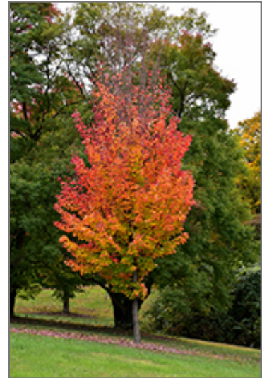
Red Rocket Red Maple in fall

Red Rocket Red Maple is recommended for the following landscape applications;