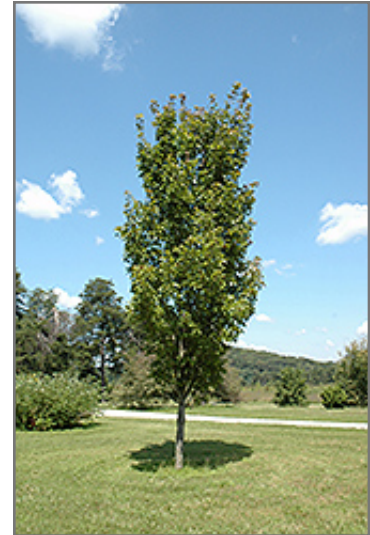
Red Rocket Red Maple

This tree should only be grown in full sunlight. It is quite adaptable, preferring to grow in average to wet conditions, and will even tolerate some standing water. It is not particular as to soil type, but has a definite preference for acidic soils, and is subject to chlorosis (yellowing) of the foliage in alkaline soils. It is somewhat tolerant of urban pollution. This is a selection of a native North American species.