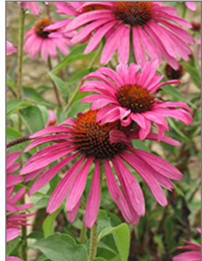
Ruby Star Coneflower flowers