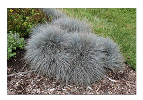
Elijah Blue Fescue

This plant does best in full sun to partial shade. It prefers to grow in average to dry locations, and dislikes excessive moisture. It is considered to be drought-tolerant, and thus makes an ideal choice for a low-water garden or xeriscape application. It is not particular as to soil type or pH. It is highly tolerant of urban pollution and will even thrive in inner city environments. This is a selected variety of a species not originally from North America. It can be propagated by division; however, as a cultivated variety, be aware that it may be subject to certain restrictions or prohibitions on propagation.