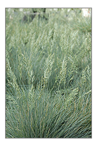
Elijah Blue Fescue foliage