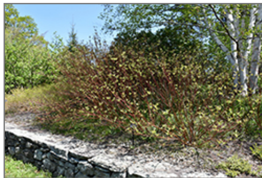
Bailey's Red Twig Dogwood in spring