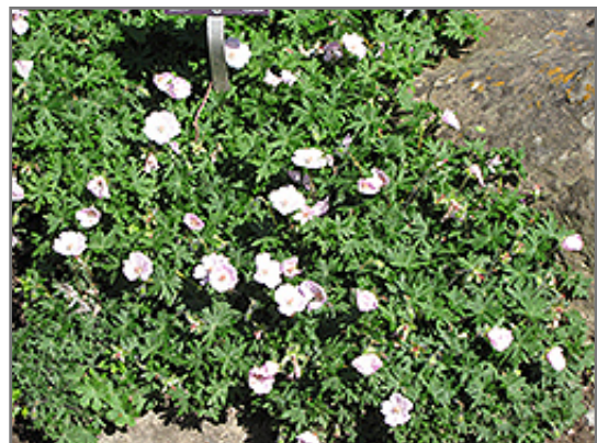
Striated Cranesbill in bloom