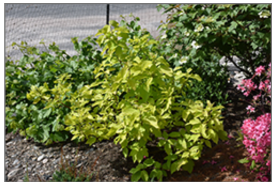
Neon Burst Dogwood