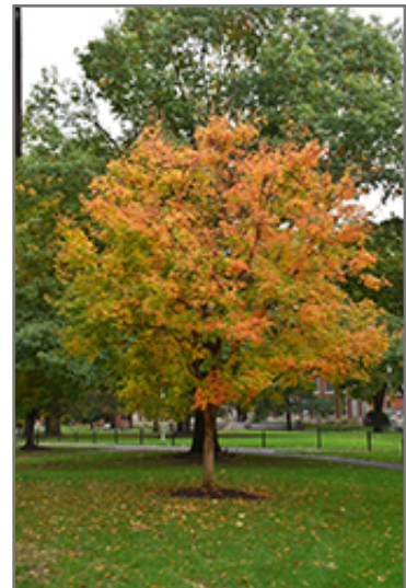
Three Flowered Maple in fall