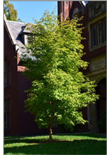
Three Flowered Maple