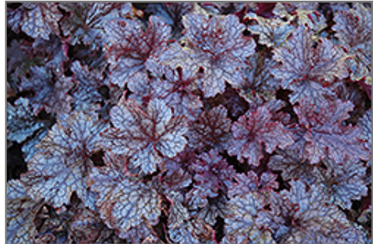
Plum Pudding Coral Bells foliage

Plum Pudding Coral Bells is recommended for the following landscape applications;