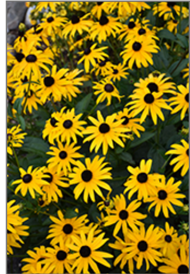
American Gold Rush Coneflower flowers

This is a relatively low maintenance plant, and should be cut back in late fall in preparation for winter. It is a good choice for attracting birds, bees and butterflies to your yard, but is not particularly attractive to deer who tend to leave it alone in favor of tastier treats. It has no significant negative characteristics.