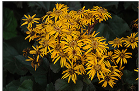
Britt Marie Crawford Rayflower flowers