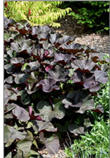
Britt Marie Crawford Rayflower foliage

This plant does best in partial shade to shade. It prefers to grow in moist to wet soil, and will even tolerate some standing water. It is not particular as to soil pH, but grows best in rich soils. It is somewhat tolerant of urban pollution. This is a selected variety of a species not originally from North America. It can be propagated by division; however, as a cultivated variety, be aware that it may be subject to certain restrictions or prohibitions on propagation.