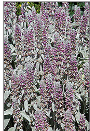
Lamb's Ears flowers