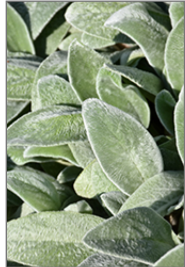
Lamb's Ears foliage

Lamb's Ears is recommended for the following landscape applications;