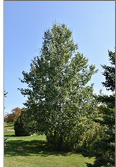
Trembling Aspen