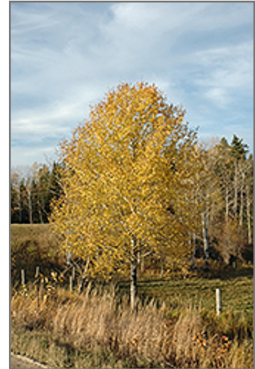
Trembling Aspen in fall

This tree should only be grown in full sunlight. It is an amazingly adaptable plant, tolerating both dry conditions and even some standing water. It is considered to be drought-tolerant, and thus makes an ideal choice for xeriscaping or the moisture-conserving landscape. It is not particular as to soil type or pH. It is quite intolerant of urban pollution, therefore inner city or urban streetside plantings are best avoided. This species is native to parts of North America.