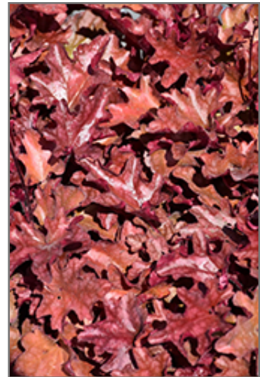
Peach Flambe Coral Bells foliage

This is a relatively low maintenance plant, and should be cut back in late fall in preparation for winter. It is a good choice for attracting hummingbirds to your yard. It has no significant negative characteristics.