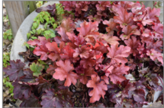
Peach Flambe Coral Bells

Peach Flambe Coral Bells is a fine choice for the garden, but it is also a good selection for planting in outdoor pots and containers. It is often used as a 'filler' in the 'spiller-thriller-filler' container combination, providing a mass of flowers and foliage against which the larger thriller plants stand out. Note that when growing plants in outdoor containers and baskets, they may require more frequent waterings than they would in the yard or garden. Be aware that in our climate, most plants cannot be expected to survive the winter if left in containers outdoors, and this plant is no exception. Contact our experts for more information on how to protect it over the winter months.