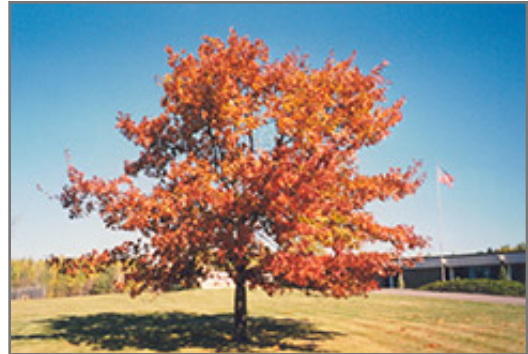
Red Oak in fall