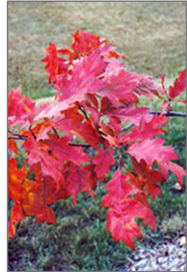
Red Oak in fall

This tree should only be grown in full sunlight. It prefers to grow in average to moist conditions, and shouldn't be allowed to dry out. It is not particular as to soil type, but has a definite preference for acidic soils, and is subject to chlorosis (yellowing) of the leaves in alkaline soils. It is highly tolerant of urban pollution and will even thrive in inner city environments. This species is native to parts of North America.