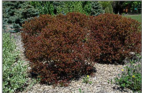
Summer Wine Ninebark