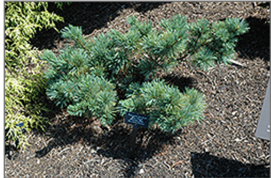
Blue Dwarf Japanese Stone Pine

Blue Dwarf Japanese Stone Pine is recommended for the following landscape applications;