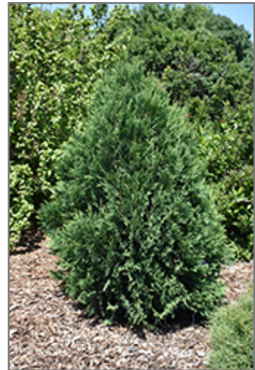
Technito Arborvitae