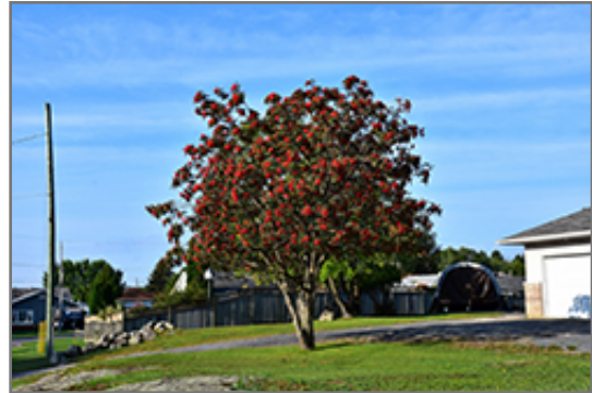
Showy Mountain Ash fruit