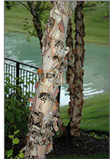
River Birch bark