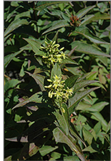
Butterfly Southern Bush Honeysuckle flowers

Butterfly Southern Bush Honeysuckle is recommended for the following landscape applications;