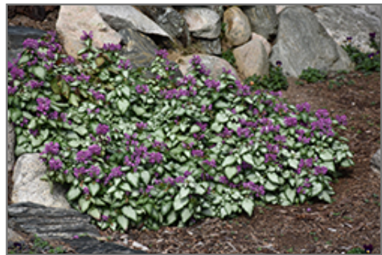
Purple Dragon Spotted Dead Nettle in bloom