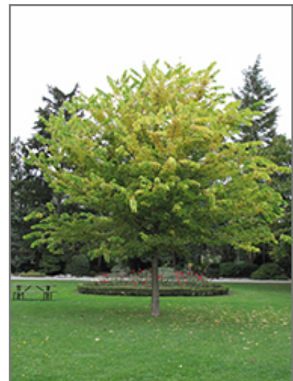
Common Hackberry in fall