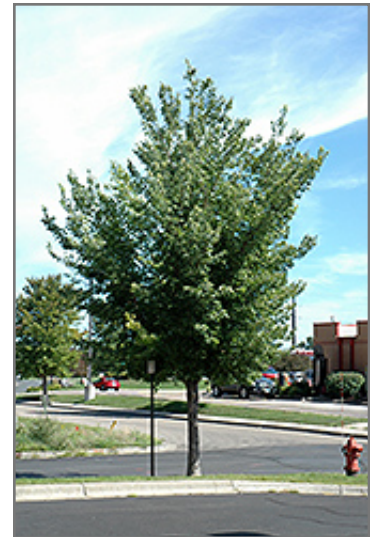
Common Hackberry