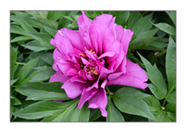
Morning Lilac Peony flowers