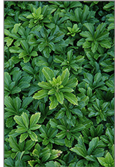
Green Sheen Japanese Spurge foliage