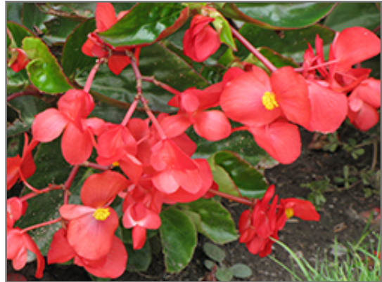
Dragon Wing Red Begonia flowers

Dragon Wing Red Begonia is an herbaceous annual with a trailing habit of growth, eventually spilling over the edges of hanging baskets and containers. Its medium texture blends into the garden, but can always be balanced by a couple of finer or coarser plants for an effective composition.