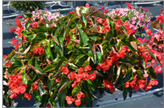
Dragon Wing Red Begonia in bloom

Dragon Wing Red Begonia is a fine choice for the garden, but it is also a good selection for planting in outdoor containers and hanging baskets. Because of its trailing habit of growth, it is ideally suited for use as a 'spiller' in the 'spiller-thriller-filler' container combination; plant it near the edges where it can spill gracefully over the pot. Note that when growing plants in outdoor containers and baskets, they may require more frequent waterings than they would in the yard or garden.