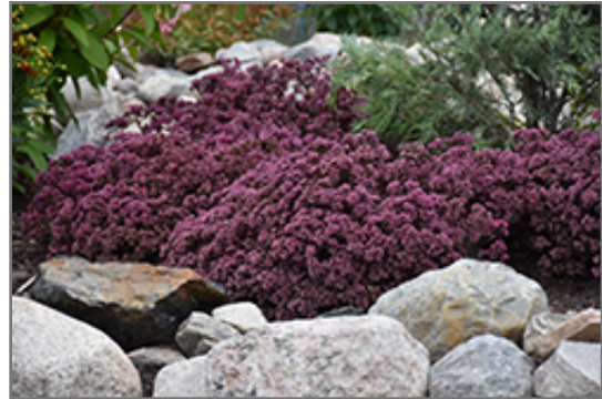
Cherry Tart Stonecrop in bloom

Cherry Tart Stonecrop is a dense herbaceous perennial with an upright spreading habit of growth. Its medium texture blends into the garden, but can always be balanced by a couple of finer or coarser plants for an effective composition.