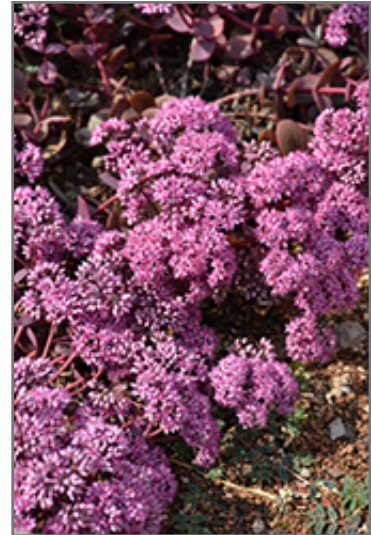
Cherry Tart Stonecrop flowers

Cherry Tart Stonecrop is a fine choice for the garden, but it is also a good selection for planting in outdoor pots and containers. It is often used as a 'filler' in the 'spiller-thriller-filler' container combination, providing a mass of flowers and foliage against which the larger thriller plants stand out. Note that when growing plants in outdoor containers and baskets, they may require more frequent waterings than they would in the yard or garden. Be aware that in our climate, most plants cannot be expected to survive the winter if left in containers outdoors, and this plant is no exception. Contact our experts for more information on how to protect it over the winter months.