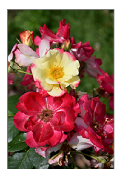
Campfire Rose flowers