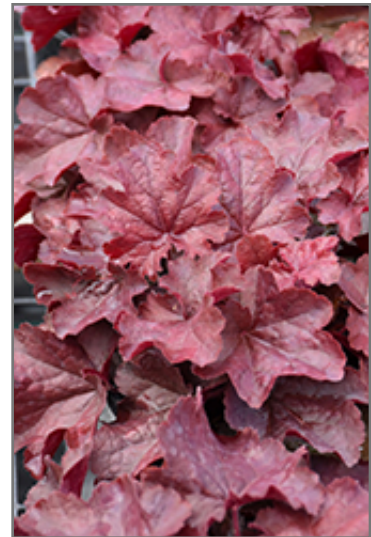
Northern Exposure Red Coral Bells foliage

Northern Exposure Red Coral Bells is recommended for the following landscape applications;