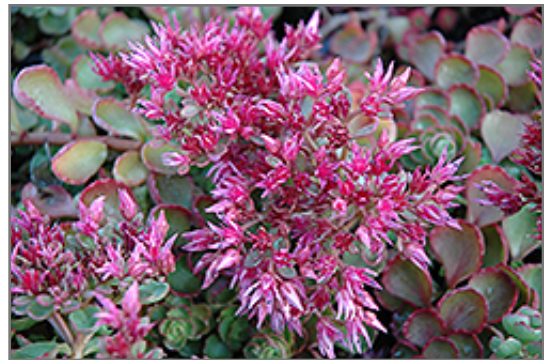
Fulda Glow Stonecrop flowers