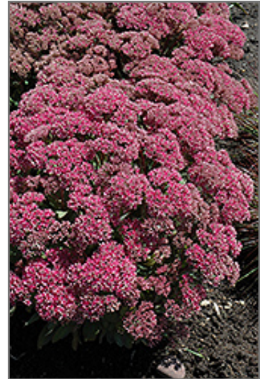
Mr. Goodbud Stonecrop flowers

Mr. Goodbud Stonecrop is recommended for the following landscape applications;