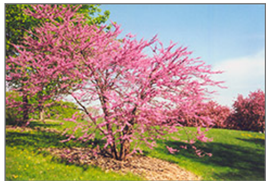
Northern Strain Redbud in bloom